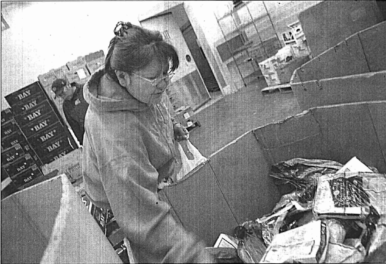
To order this photo, go to http://photos.azdailysun.com